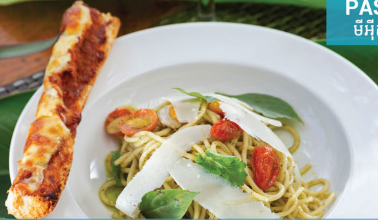
19 BASIL PESTO មីអ៊ីតាលីរសជាតិប៊ុសស្កូ Pesto, Cherry Tomato, White Wine, Grana Padano