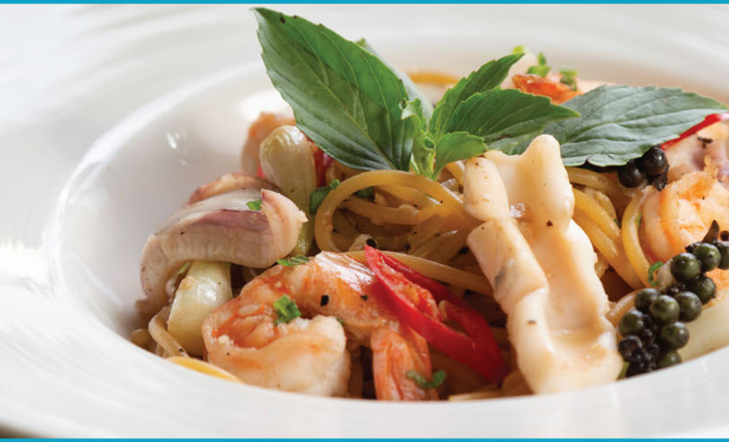
23 NAPOLITAN ភីហ្សាបន្លែ Spaghetti, Tomato Sauce, Onions, Garlic, Parsley.